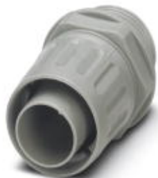
Cable gland made from PP with metric thread, rotatable, IP54 protection

Please be informed that the data shown in this PDF Document is generated from our Online Catalog. Please find the complete data in the user's documentation. Our General Terms of Use for Downloads are valid ( http://phoenixcontact.com/download )