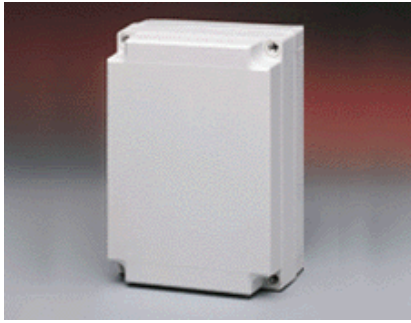
This is a sample photo.