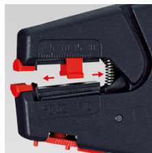
12 40 200: Adjustable length stop