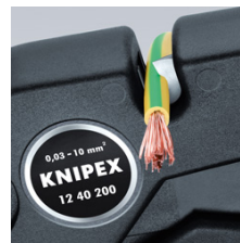
Wire cutter for multiple stranded wire cables up to 10.0 mm 2