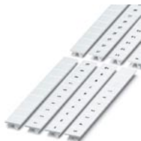
Zack marker strip, 10-section, vertically labeled with the consecutive numbers: 41 ... 50, white

Please be informed that the data shown in this PDF Document is generated from our Online Catalog. Please find the complete data in the user's documentation. Our General Terms of Use for Downloads are valid ( http://download.phoenixcontact.com )