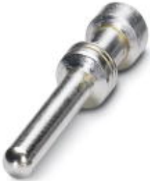
Turned 2.5 crimp contact, individual male contact, core diameter 2.5 mm 2 , silver-plated

Please be informed that the data shown in this PDF Document is generated from our Online Catalog. Please find the complete data in the user's documentation. Our General Terms of Use for Downloads are valid ( http://phoenixcontact.com/download )