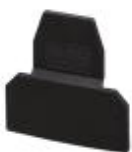
End cover, Length: 56 mm, Width: 2.5 mm, Height: 66.5 mm, Color: black