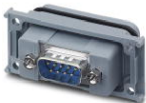
D-SUB panel mounting frame, shell size 1, with nine signal contacts, pin, gender changer, shielded, IP67 degree of protection

Please be informed that the data shown in this PDF Document is generated from our Online Catalog. Please find the complete data in the user's documentation. Our General Terms of Use for Downloads are valid ( http://phoenixcontact.com/download )