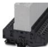
Modular socket element, 2-position, for holding two circuit breakers, each with a single position

Box mounting base - TMCP SOCKET M - 0916589