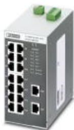
Ethernet Switch, 16 TP RJ45 ports, automatic detection of data transmission speed of 10 or 100 Mbps (RJ45), autocrossing function

Please be informed that the data shown in this PDF Document is generated from our Online Catalog. Please find the complete data in the user's documentation. Our General Terms of Use for Downloads are valid ( http://phoenixcontact.com/download )