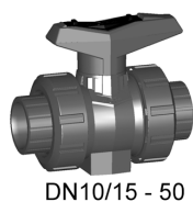
DN10/15 - 50