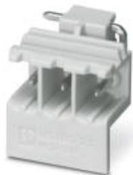
Header, Nominal current: 16 A, Rated voltage (III/2): 320 V, Number of positions: 3, Pitch: 5 mm, Mounting: Soldering

Please be informed that the data shown in this PDF Document is generated from our Online Catalog. Please find the complete data in the user's documentation. Our General Terms of Use for Downloads are valid ( http://phoenixcontact.com/download )