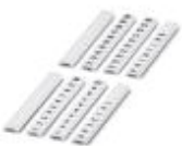
Zack Marker strip, flat, Strip, white, labeled, Printed horizontally: Consecutive numbers 1 - 10, 11 - 20, etc. up to 491 - 500, Mounting type: Snap into flat marker groove, for terminal block width: 5 mm, Lettering field: 5.15 x 5.15 mm

Zack Marker strip, flat - ZBF 5,LGS:FORTL.ZAHLEN - 0808671