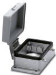
HEAVYCON panel mounting base B50, for double locking latch, height 28 mm, with cover

Please be informed that the data shown in this PDF Document is generated from our Online Catalog. Please find the complete data in the user's documentation. Our General Terms of Use for Downloads are valid ( http://phoenixcontact.com/download )