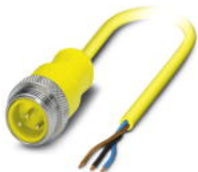
Sensor/Actuator cable, 3-position, PVC, Yellow RAL 1021, Plug straight 7/8"-16UNF, A-coded, on free cable end, Cable length: 6 m

Please be informed that the data shown in this PDF Document is generated from our Online Catalog. Please find the complete data in the user's documentation. Our General Terms of Use for Downloads are valid ( http://phoenixcontact.com/download )