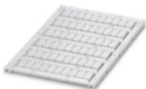
The figure shows the UCT-TM 6 version

UniCard materials for thermal transfer printer, for labeling Weidmüller, Conta Clip, and Klemsan terminal blocks, 60-section, can be labeled with THERMOMARK CARD and BLUEMARK LED, color: white