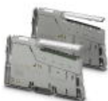
Connector set for distance terminal

Connector set - IB IL DOR LV-PLSET - 2742667