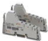
Inline distance terminal, without accessories

Inline terminal - IB IL DOR LV-SET - 2742641