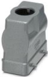
HEAVYCON B16 sleeve housing, for double locking latch, height: 76 mm, with 1 x M40 thread, straight cable outlet

Please be informed that the data shown in this PDF Document is generated from our Online Catalog. Please find the complete data in the user's documentation. Our General Terms of Use for Downloads are valid ( http://phoenixcontact.com/download )