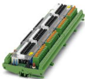
VARIOFACE output module, 32 channels for Yokogawa ADV 551, ADV 561 output modules.

Please be informed that the data shown in this PDF Document is generated from our Online Catalog. Please find the complete data in the user's documentation. Our General Terms of Use for Downloads are valid ( http://phoenixcontact.com/download )