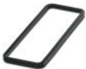
Profile gasket for HEAVYCON EVO supporting base element type B24

Profile gasket - HC-B24-SP-RBK - 1407709