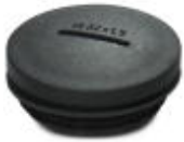
Filler plug, plastic, size: M40