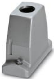
HEAVYCON ADVANCE EMC sleeve housing B16, with screw locking, height 100 mm, with 1xM32 support, and straight cable outlet

Please be informed that the data shown in this PDF Document is generated from our Online Catalog. Please find the complete data in the user's documentation. Our General Terms of Use for Downloads are valid ( http://phoenixcontact.com/download )