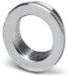
Reducing adapter, metal, M32 to M25, including O-ring

Reducing adapter - REDUC-M-KV-M32/M25 - 1647637