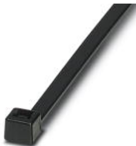
Cable binders for quick and permanent fastening, UV-resistant and weatherproof (ISO 4892_QUV-B 600 h)

Please be informed that the data shown in this PDF Document is generated from our Online Catalog. Please find the complete data in the user's documentation. Our General Terms of Use for Downloads are valid ( http://download.phoenixcontact.com )