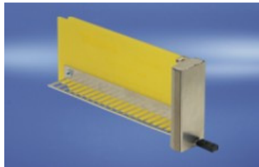
Filler module, single, full-size with air baffle