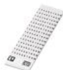
Marker card, Card, white, labeled, Horizontal: Consecutive numbers 1 - 10, 11 - 20, etc. up to 91 - 99, Mounting type: Adhesive, for terminal block width: 2.54 mm, Lettering field: 2.54 x 2.8 mm

Marker card - SK 2,54/2,8:FORTL.ZAHLEN - 0804853