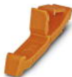
Latching, Number of positions: 1, Color: orange