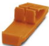
Latching, Number of positions: 2, Color: orange