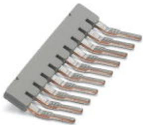
Insertion bridge, 10-pos., fully insulated

Please be informed that the data shown in this PDF Document is generated from our Online Catalog. Please find the complete data in the user's documentation. Our General Terms of Use for Downloads are valid ( http://phoenixcontact.com/download )