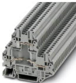
Feed-through terminal block, Cross section: 0.14 mm 2 - 4 mm 2 , AWG: 26 - 12, Connection type: Screw connection, Width: 5.2 mm, Color: gray, Mounting type: NS 35/7,5, NS 35/15

Please be informed that the data shown in this PDF Document is generated from our Online Catalog. Please find the complete data in the user's documentation. Our General Terms of Use for Downloads are valid ( http://download.phoenixcontact.com )