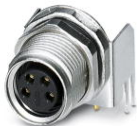
Sensor/actuator flush-type connector, socket, 4-pos. M8, rear/screw mounting with M10 fastening thread, with angled solder connection

Please be informed that the data shown in this PDF Document is generated from our Online Catalog. Please find the complete data in the user's documentation. Our General Terms of Use for Downloads are valid ( http://phoenixcontact.com/download )