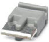
Single plug-in bridge, Length: 6 mm, Number of positions: 2, Color: gray

Single plug-in bridge - FBST 6-PLC GY - 2966825