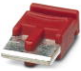
Single plug-in bridge, Length: 6 mm, Number of positions: 2, Color: red

Single plug-in bridge - FBST 6-PLC RD - 2966236