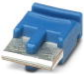
Single plug-in bridge, Length: 6 mm, Number of positions: 2, Color: blue

Single plug-in bridge - FBST 6-PLC BU - 2966812