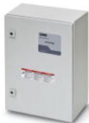
Indoor/outdoor lightning arrester and TVSS system for 120/240 single/split phase

Please be informed that the data shown in this PDF Document is generated from our Online Catalog. Please find the complete data in the user's documentation. Our General Terms of Use for Downloads are valid ( http://phoenixcontact.com/download )