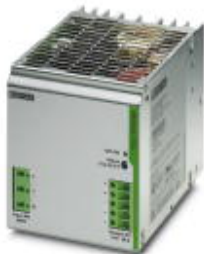
DIN rail power supply unit, primary-switched, 1-phase, input: 600 V DC, output: 24 V DC/20 A

Please be informed that the data shown in this PDF Document is generated from our Online Catalog. Please find the complete data in the user's documentation. Our General Terms of Use for Downloads are valid ( http://phoenixcontact.com/download )