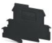
End cover for TERMITRAB TT-2-PE-M-... and TT-2/2-M-...