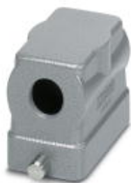
HEAVYCON B10 sleeve housing, for single locking latch, height: 56 mm, with 1 x M20 thread, lateral cable outlet

Please be informed that the data shown in this PDF Document is generated from our Online Catalog. Please find the complete data in the user's documentation. Our General Terms of Use for Downloads are valid ( http://phoenixcontact.com/download )