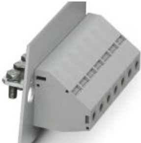
Panel feed-through terminal block, Connection method: Screw connection, Screw connection, Load current : 150 A, Cross section: 16 mm 2 - 50 mm 2 , AWG 6 - 1/0, Width: 18.8 mm, Color: gray

Please be informed that the data shown in this PDF Document is generated from our Online Catalog. Please find the complete data in the user's documentation. Our General Terms of Use for Downloads are valid ( http://phoenixcontact.com/download )