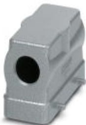
HEAVYCON B16 sleeve housing, for double locking latch, height: 65 mm, with 1 x M25 thread, lateral cable outlet

Please be informed that the data shown in this PDF Document is generated from our Online Catalog. Please find the complete data in the user's documentation. Our General Terms of Use for Downloads are valid ( http://phoenixcontact.com/download )