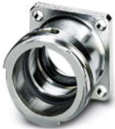
Panel mounting base, straight, Bayonet locking, M23, Axial O-ring, 4xØ3,2, Shielded: Yes, Panel thickness min.: 1.5 mm, Cable diameter: 0 mm...0 mm

Please be informed that the data shown in this PDF Document is generated from our Online Catalog. Please find the complete data in the user's documentation. Our General Terms of Use for Downloads are valid ( http://download.phoenixcontact.com )