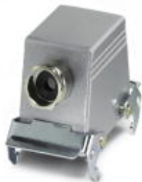
Sleeve housing, with double locking latch, height 76 mm, with screw connection, 1x Pg29, lateral cable entry

Please be informed that the data shown in this PDF Document is generated from our Online Catalog. Please find the complete data in the user's documentation. Our General Terms of Use for Downloads are valid ( http://phoenixcontact.com/download )