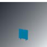
End cover, Length: 28 mm, Width: 1 mm, Color: blue