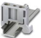
End clamp width: 6 mm, color: gray