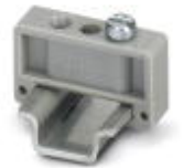
End clamp, width: 6.2 mm, color: gray