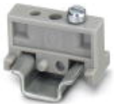
End clamp, width: 6.2 mm, color: gray