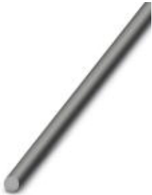
Connection pin, Color: black

Please be informed that the data shown in this PDF Document is generated from our Online Catalog. Please find the complete data in the user's documentation. Our General Terms of Use for Downloads are valid ( http://download.phoenixcontact.com )