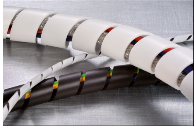
Spiral binding SBPEFR is available in a wide range of diameters and in colours black and white.

Spiral binding made of standard polyethylene can be found in the Product Catalogue.