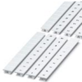
Zack marker strip, 10-section, horizontally labeled with the consecutive numbers: 21 ... 30, white

Please be informed that the data shown in this PDF Document is generated from our Online Catalog. Please find the complete data in the user's documentation. Our General Terms of Use for Downloads are valid ( http://download.phoenixcontact.com )