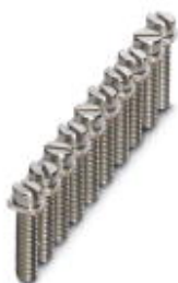
Jumper, Number of positions: 10, Color: silver

Please be informed that the data shown in this PDF Document is generated from our Online Catalog. Please find the complete data in the user's documentation. Our General Terms of Use for Downloads are valid ( http://phoenixcontact.com/download )