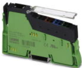
The illustration shows the version IB IL 24 PWR IN/F-PAC

Inline power terminal block, complete with accessories (plug and labeling field), 24 V DC, with fuse (main and segment voltage) and diagnostics, transmission speed 2 Mbaud