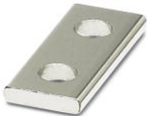
Connection element, Number of positions: 2, Color: silver

Please be informed that the data shown in this PDF Document is generated from our Online Catalog. Please find the complete data in the user's documentation. Our General Terms of Use for Downloads are valid ( http://phoenixcontact.com/download )