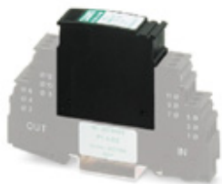
Protective connector PT with protective circuit for a 4-wire floating signal circuit. Nominal voltage: 24 V AC

Please be informed that the data shown in this PDF Document is generated from our Online Catalog. Please find the complete data in the user's documentation. Our General Terms of Use for Downloads are valid ( http://phoenixcontact.com/download )