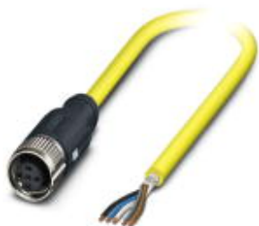
Sensor/Actuator cable, 5-position, PVC, Yellow RAL 1021, shielded, Free cable end, on Socket straight M12 SPEEDCON, A-coded, Cable length: 5 m

Please be informed that the data shown in this PDF Document is generated from our Online Catalog. Please find the complete data in the user's documentation. Our General Terms of Use for Downloads are valid ( http://download.phoenixcontact.com )