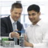
Startup of Phoenix Contact network components and support regarding analysis, consultation/planning or configuration/startup together with a responsible person employed by the initiator.

Service material - FL START-UP SUPPORT - 2701426