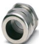
Metal screw connection up to 5 bar, thread length: 6 mm, cable diameter: 11 - 16 mm, WAF 27, screw connection: M20

Cable gland - HC-M-KV-M20(11-16) - 1645998