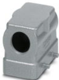
HEAVYCON B10 sleeve housing, for double locking latch, height: 56 mm, with 1 x M20 thread, lateral cable outlet

Please be informed that the data shown in this PDF Document is generated from our Online Catalog. Please find the complete data in the user's documentation. Our General Terms of Use for Downloads are valid ( http://phoenixcontact.com/download )