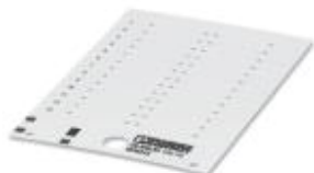
The figure shows a version of the article

Markers for sticking on, screwing or riveting, Card, yellow, unlabeled, can be labeled with: THERMOMARK CARD, Mounting type: Screws, rivets, Adhesive, Lettering field: 28 x 10 mm