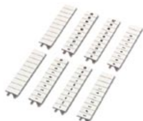
Zack marker strip, 10-section, horizontally labeled with the consecutive numbers: 331 ... 340, white, Width: 5 mm

Please be informed that the data shown in this PDF Document is generated from our Online Catalog. Please find the complete data in the user's documentation. Our General Terms of Use for Downloads are valid ( http://download.phoenixcontact.com )