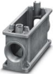
HEAVYCON ADVANCE B24 box mounting base, for M6 screw locking, salt-water-resistant aluminum, with 2 x M25 thread, without surface coating

Please be informed that the data shown in this PDF Document is generated from our Online Catalog. Please find the complete data in the user's documentation. Our General Terms of Use for Downloads are valid ( http://phoenixcontact.com/download )